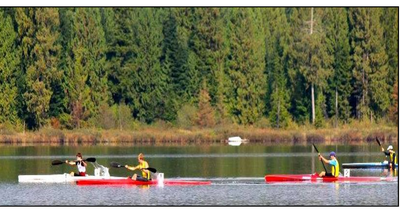
Northwest Washington Fair—August