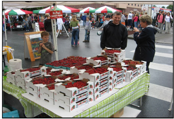
Old Fashioned 4th of July—July