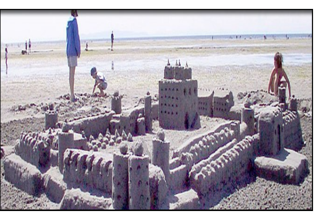
Everson Summer Festival—July